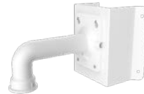
TD-YZJ0808+TD-YZJ0601 Corner mounting bracket