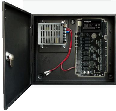
C3-100/200/400 Package B