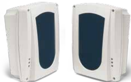
BF 100 A

BF TEST: necessary BF100R's calibration filter